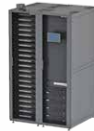
Integrated cabinet+network cabinet or Integrated cabinet+battery cabinet